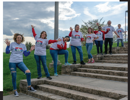
Impact Grant Recipient, TAFE